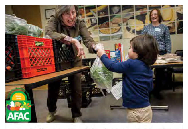
The Arlington Food Assistance Center is a community-based nonprofit that provides supplemental groceries to our Arlington neighbors in need.