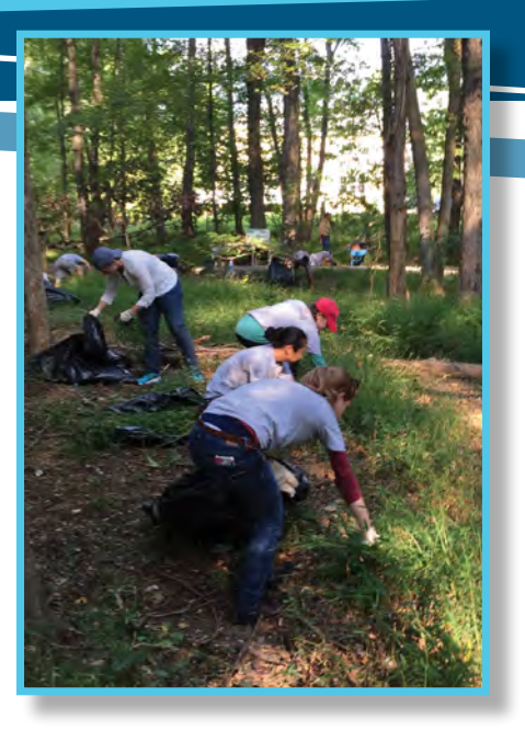
Dewberry employees helping clean Nottoway Park, Vienna, VA, National Public Lands Day

Keeping watersheds clean and helping to protect valuable natural resources are also important volunteer activities for Dewberry employees nationwide. Last year, employees participated in clean-up and invasive species removal events at parks in Fairfax.